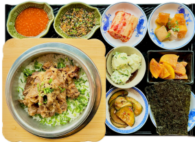
BULGOGI SOTBAP | $24 불고기술밥 GRILLED THINLY SLICED BEEF