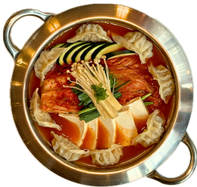
KIMCHI HOTPOT | $32 감치전골 KIMCHI, PORK, KIMCHI MANDOO, TOFU, MUSHROOM