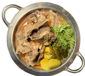
GAMJA HOTPOT | $38 감자탕 BRAISED PORK BONE, POTATO, NAPA CABBAGE, UGOJI