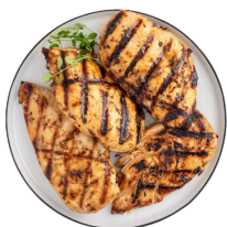
GRILLED CHICKEN | $24 닭구이 KOREAN STYLE GRILLED CHICKEN