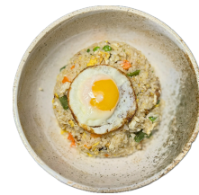
FRIED RICE | $15

SPICY BROTH NOODLE WITH CALAMARI, CLAM, JUMBO SHRIMP AND BRISKET