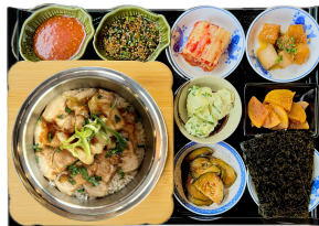
BRAISED PORK SOTBAP | $24 삼겹살술밥 PORK BELLY, SAVORY SOY, FRIED GARLIC