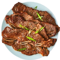
LA GALBI | $29 LA 갈비 KOREAN STYLE GRILLED BEEF RIB MARINATED WITH HOUSE SPECIAL SAUCE