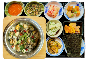
OYSTER & MUSSEL SOTBAP | $26 굴술밥 OYSTER, MUSSEL, SCALLOP, TOBIKO