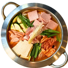
BUDAE HOTPOT | $34 부대찌개 "AKA, ARMY STEW" SPAM, SAUSAGE, TOFU, ZUCCHINI, KIMCHI, SCALLION, PORK

KOREAN SIGNATURE SHARABLE POT, WILL BE COOKING ON THE TABLE SERVING WITH RICE