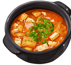
KIMCHI STEW | $17