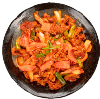
SPICY PORK | $27 제육구이 CHAR-GRILLED PORK WITH GOCHUJANG SAUCE