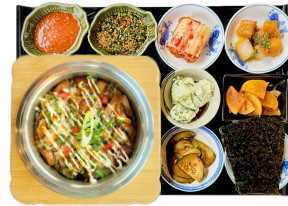
TERIYAKI CHICKEN SOTBAP | $24 치킨테리야기술밥 GRILLED CHICKEN, TERIYAKI, MAYO, FRIED GARLIC