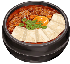
BEAN PASTE STEW | $16

MOST FAMOUS KOREAN SOUP SERVING WITH RICE