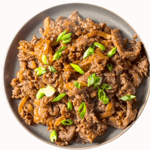
BULGOGI | $27 불고기 THINLY SLICED BEEF MARINATED WITH SAVORY SOY SAUCE

SERVED WITH RICE, LETTUCE WRAP, AND CHEF CHOICE SIDE DISHES