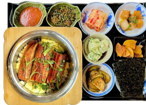
UNAGI SOTBAP | $27 장어계란술밥 GRILLED EEL, SCRAMBLED EGG