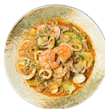
BRISKET CLAM JJAMBONG | $21

PORK, STIR FRIED ONION, CABBAGE, ZUCCHINI WITH BLACK BEAN PASTE SERVE WITH FRIED EGG