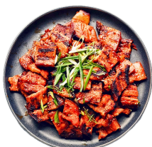
GRILLED PORK | $24 양념 돼지갈비 AUTHENTIC KOREAN GRILLED PORK STEAK