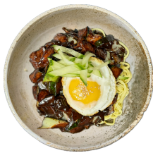
JJAJANGMYEON | $17

KOREAN CHINESE SIGNATURE DISH MADE IN THE WOK