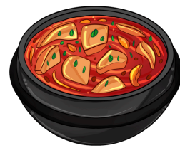
SOFT TOFU STEW | $17