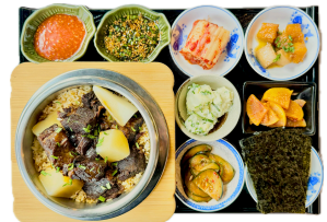
BRAISED SHORT RIB SOTBAP | $28 갈비술밥 MARINATED SHORT RIB