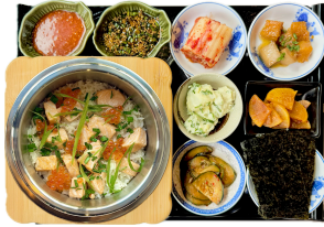
SALMON SOTBAP | $26 연어술밥 ATLANTIC SALMON, SALMON CAVIAR

KOREAN POT COOKED RICE, ALSO KNOWN AS "술밥" IN KOREA, IS A TRADITIONAL RICE DISH WHERE RICE IS COOKED IN A HEAVY STONE OR METAL POT CALLED SOT "술".