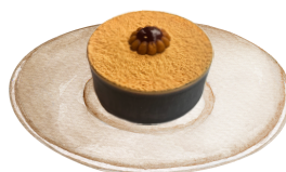
MATCHA TIRAMISU | $11